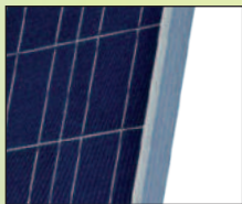
Backsheet: white Frame: silver

Dimensions: (L) 1640 mm x (B) 990 mm x (T) 34 mm; Weight: 18,5 KG; Nummer of cells: 60; Cell size: 156 mm x 156 mm Cell material: polycrystalline Si; Front cover: Solar glass, Backside film: polymer Frame material: aluminum Cable length: 500 mm; Connector type: MC4 compatible Bypass diodes: 3 Manufactured and tested according to IEC standard 61215 and DIN 61730. TÜV-Nord certified. Climate neutral prepared.